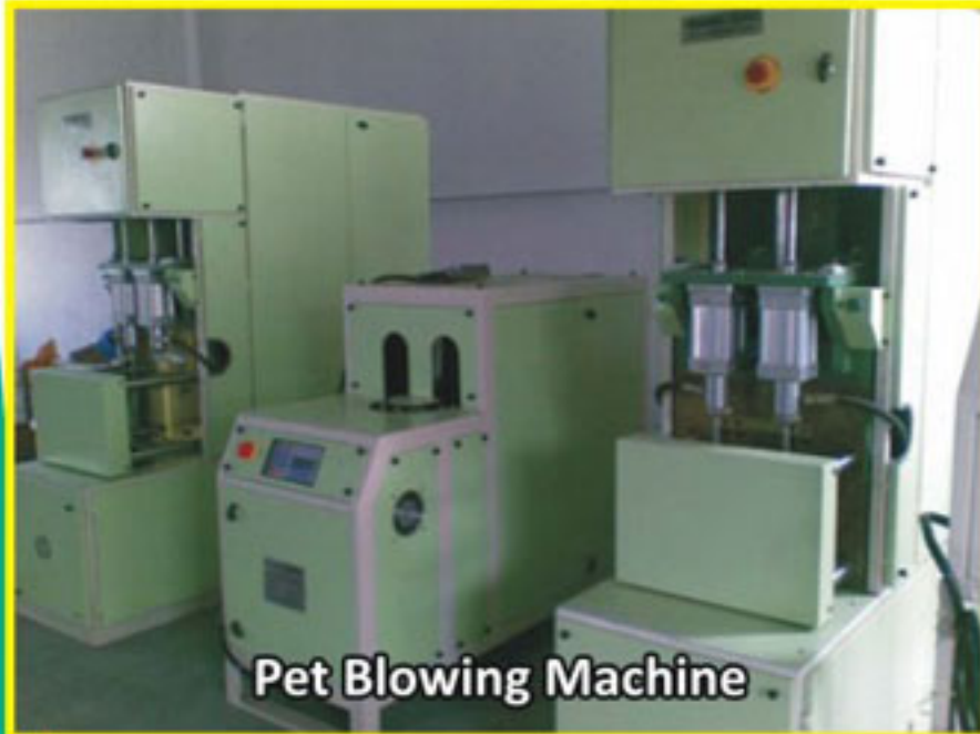
Pet Blowing Machine