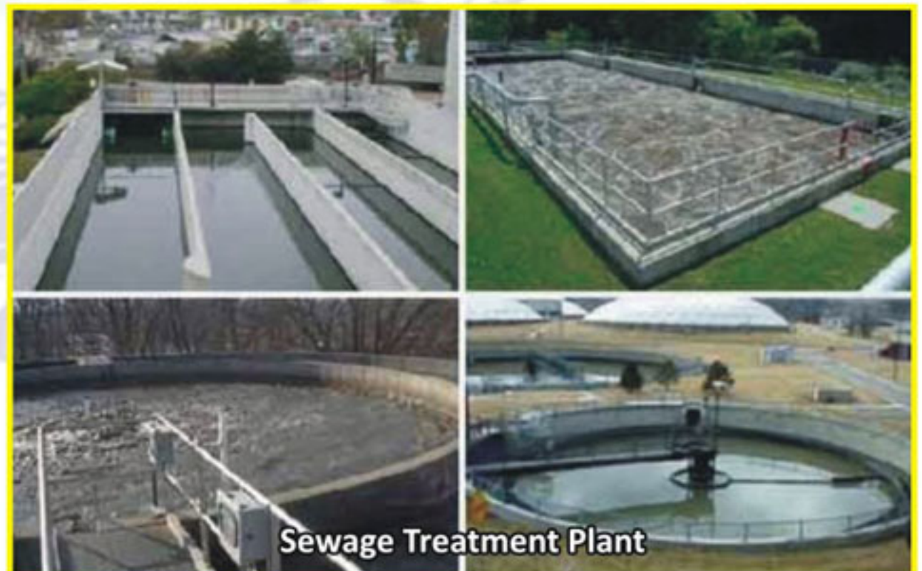
Sewage Treatment Plant