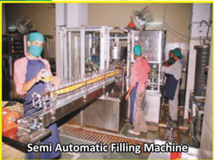
Semi Automatic Filling Machine